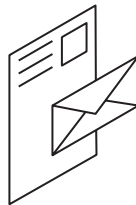
170 GSM STATIONERY